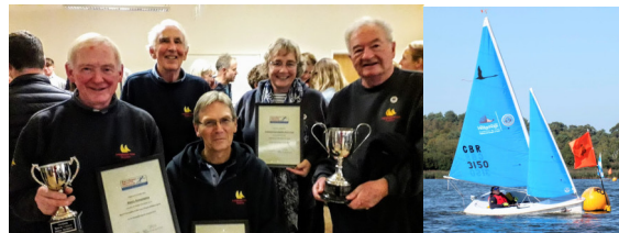
The Hansa Team