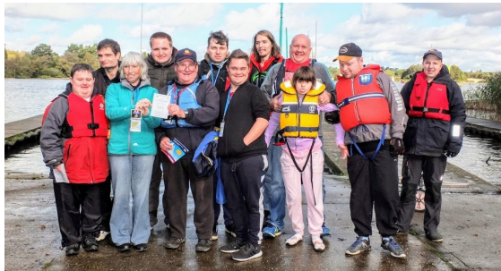
The Saturday morning Progress Group

ashore to be debriefed and a coveted cup awarded to the most improved sailor for that session. This does not mean the best sailor but the most improved. As well as the trophy, sailors this season have been achieving the RYA Gold level. It is always so nice to see their enthusiasm, and the look of pride when they are singled out for an award or trophy. Well done all of you. I am proud to be part of your group.