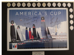
The new Ben Ainslie Trophy – now hanging in the clubhouse