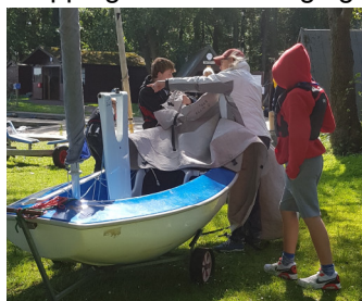
Rigging Instruction and learning to gain independence

sailors only have a short amount of time in their busy timetable to get as much as they can out of learning how to sail. This summer we had quite a few days where conditions meant we had to learn how to rig and do some sailing theory instead of going onto the water. But as we all know there is always something new to learn, so I never feel time is wasted. In fact, the path to sailing independently, which is what we aim for, was very satisfying this year with nearly all the students at Stepping Stones managing it!