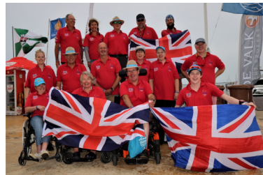
The British Team in Portimão

The sailing took place in a picturesque bay at the mouth of the Arade River just inside a breakwater so that we were spared the worst of the Atlantic chop. It did mean that the race course was tidal, which was a first for some, but it didn't seem to cause too many issues. The wind started gently over the first couple of days resulting in lots of changes to the course which took some getting used to for the new sailors. The wind did increase as the week went on with a stronger blow by day four. Unfortunately, the last day was hampered by a heavy fog so just the 303 two person boats sailed while everyone else packed up.